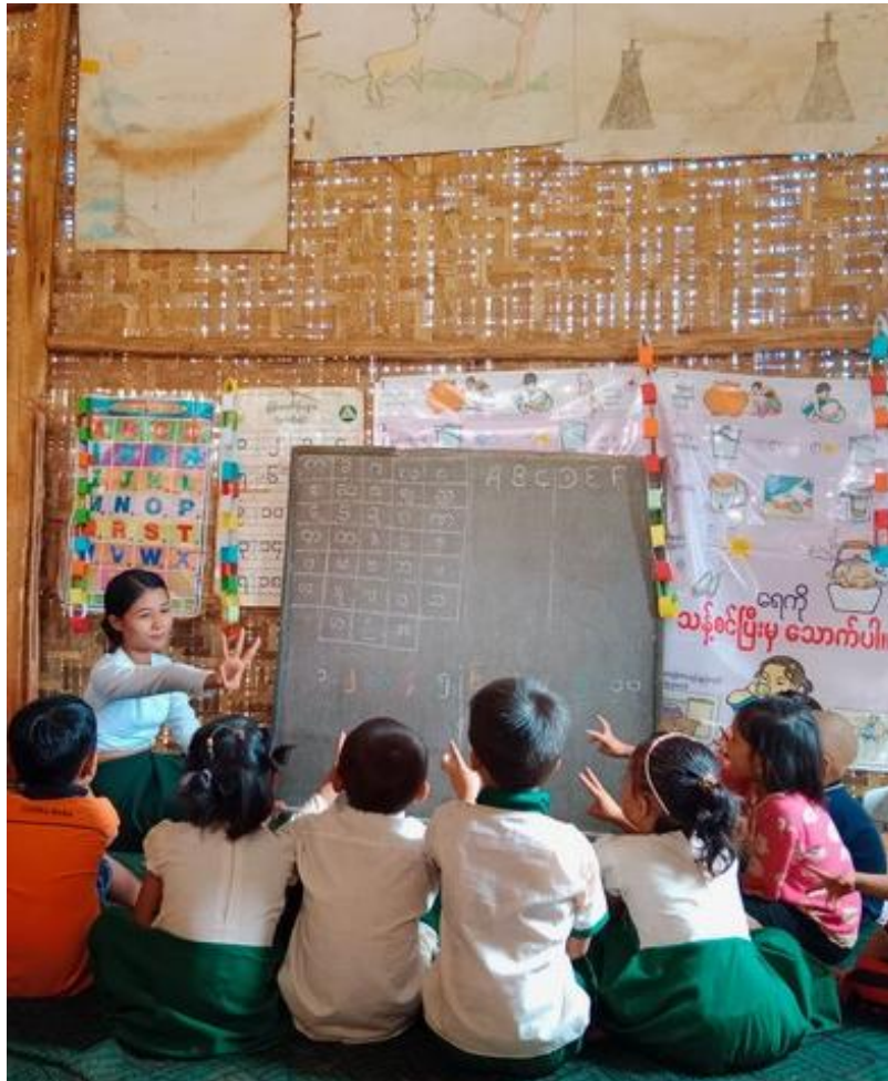
Classroom Observation at a village school