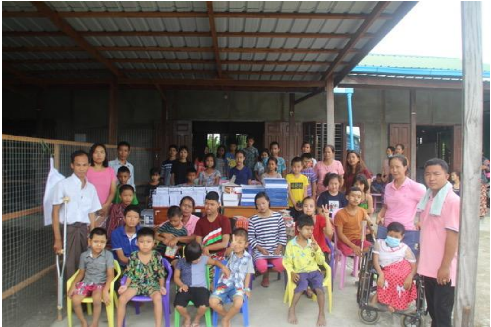
Handing over of School Resources at one of the village schools in the programme.